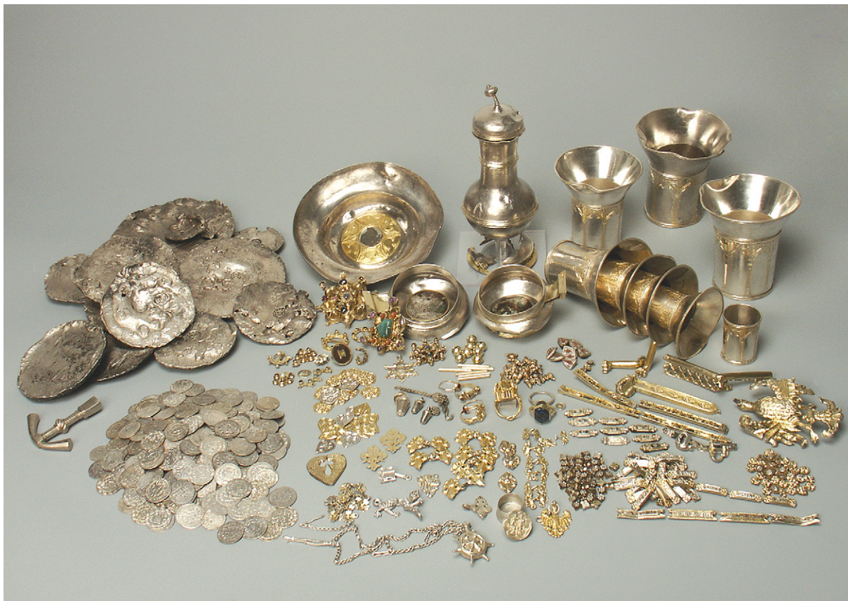
Fig. 3. Miscellany of jewelry, tableware, coins and ingots, part of the Erfurt Treasure, discovered in 1998 in the Jewish Quarter of Erfurt, Germany. Hidden before 1348/9.