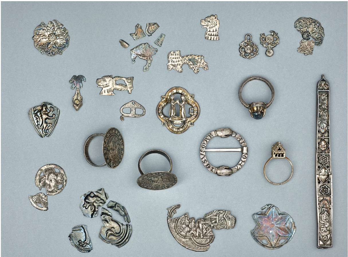
Fig. 1. Miscellany of jewelry, part of the Weißenfels Treasure, discovered in 1823-6 near Weißenfels. Hidden circa 1348/9. Kulturstiftung Sachsen-Anhalt, Kunstmuseum Moritzburg Halle (Saale).