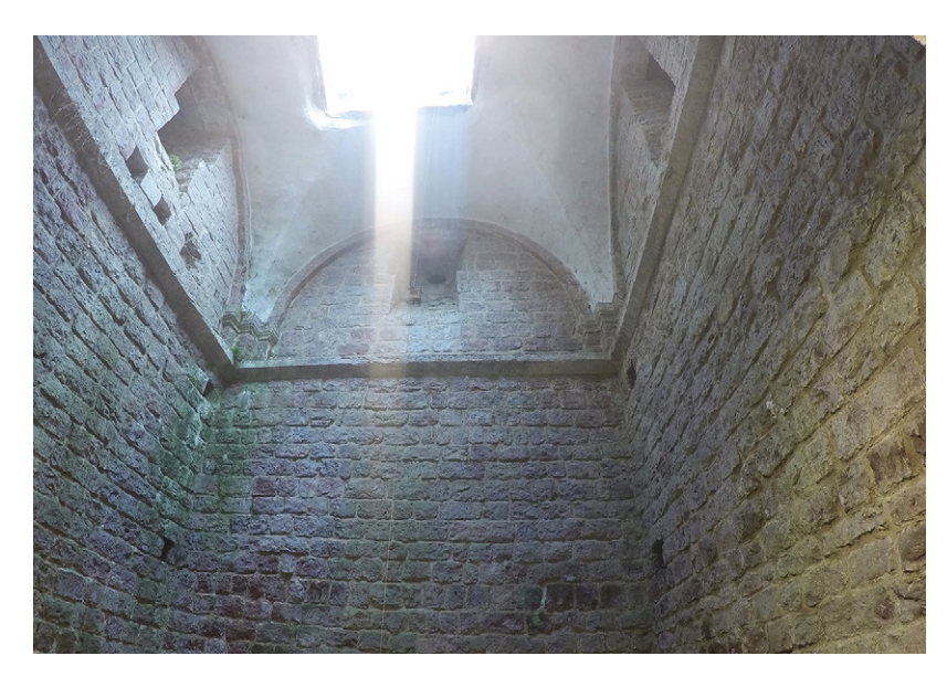
Fig. 2. Speyer ritual bath, view upwards into the shaft. Speyer, Germany, twelfth century.

They include various types of washing of people and of objects, and in some cases also full ritual immersion. By the Middle Ages, however, most of the biblical directives regarding purity were no longer in effect, considered either impossible or irrelevant following the destruction of the Second Temple in 70 CE.