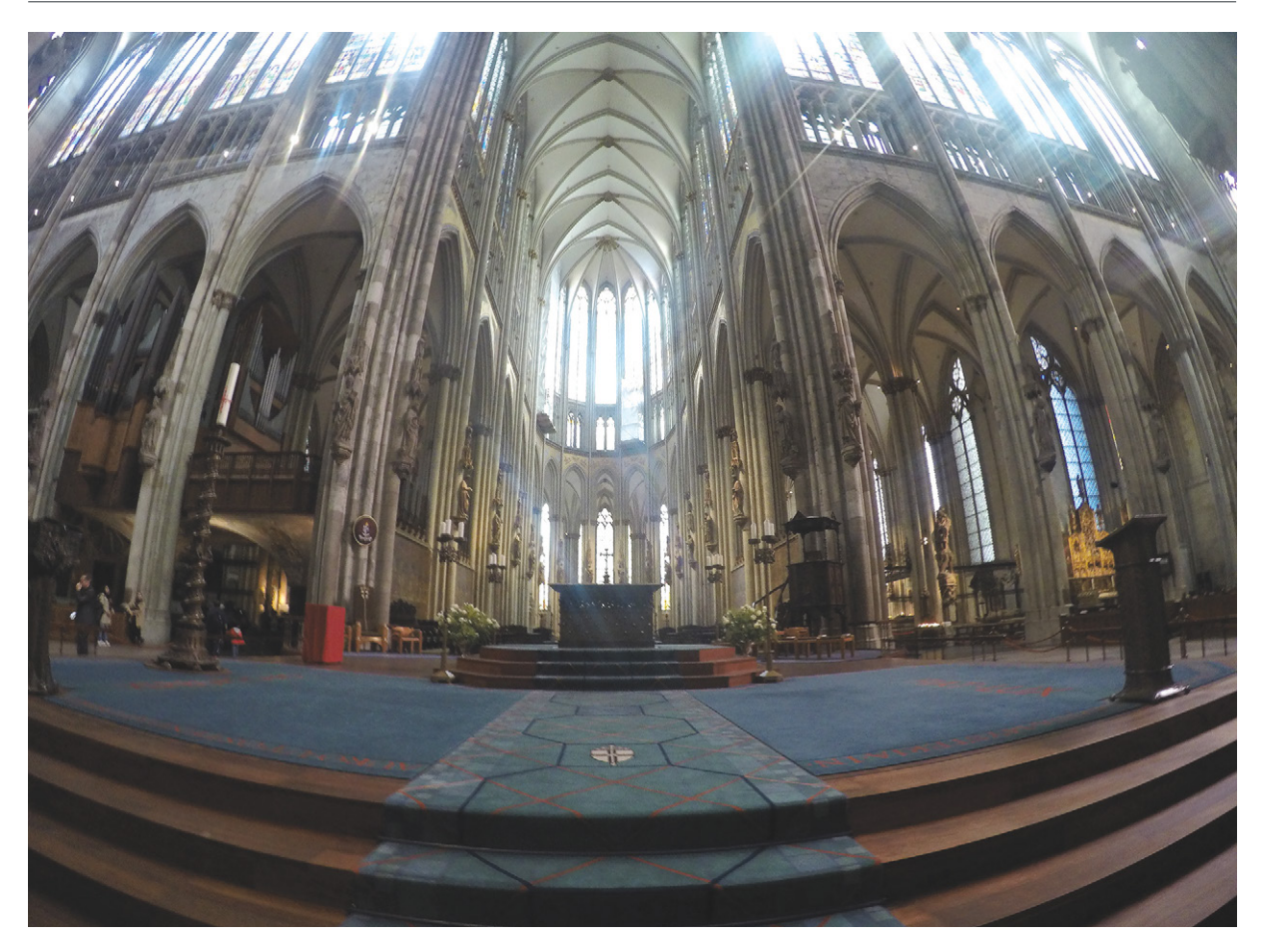
Fig. 5. Cologne Cathedral, view eastwards to the altar. Cologne, Germany, erected in the twelfth century (additions fourteenth century, completed nineteenth century).

shared this common setting, the immerser always enjoyed the experiential benefits such a space afforded. One might even speculate that the development of spectacular sites for purification was a factor in the expansion of immersion practices beyond set biblical and mandatory religious categories. The connective theme amongst the various types of immersion is transformation: be it persons making the shift from impure to pure, vessels crossing over from a Christian maker to a Jewish user, someone converting from a different faith to Judaism or a Jew returning to the faith after apostasy. For those following the advice offered in Sefer Or Zaru'a quoted above and immersing as part of a repentance process, the immersion was meant for the spiritual goal of return from sin. Having the immersion occur in such a spectacular space could have heightened the sense of change, of the soul or self being cleansed with the washed body. Immersion spaces, then, may have impacted on the resurgence of immersion ceremonies.