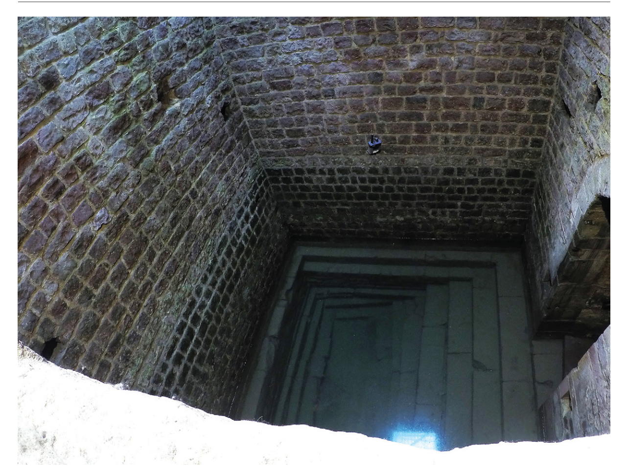
Fig. 1. Speyer ritual bath, view into the shaft from the ante chamber. Speyer, Germany, twelfth century.