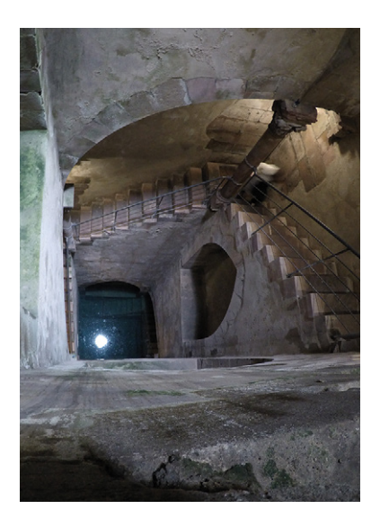
Fig. 4: Friedberg ritual bath, view downwards towards the immersion pool. Friedberg (Hesse), Germany 1260.

These practices were showcased by a new type of space, monumental ritual baths ( mikva'ot plural, mikveh singular). Medieval ritual baths found in certain areas of Germany, France, and northern Spain have unique architectural characteristics that are incomparable with earlier models. While many mikva'ot dating from the Second Temple period in the Land of Israel have been discovered, these were often small and rarely